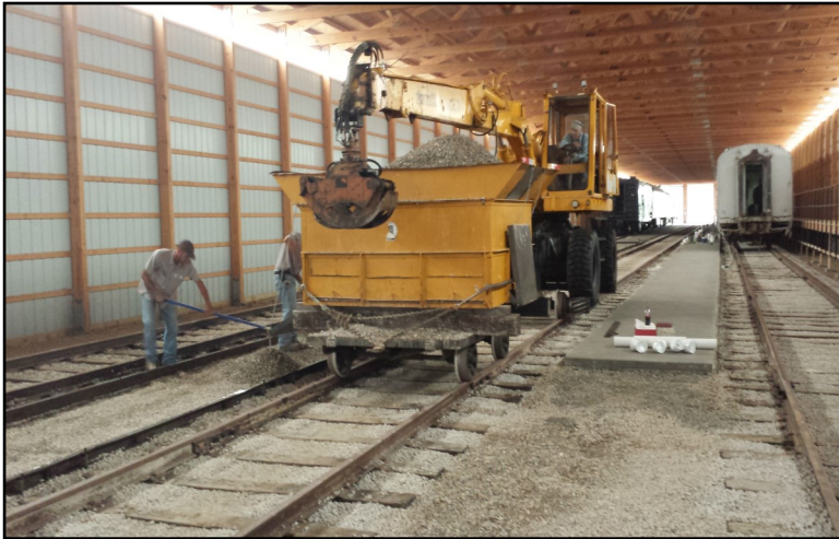
Left; The new car barn is receiving an additional improvement with the installation of sidewalks between the tracks. Right; About to board at Monticello is a young couple from the 1920's