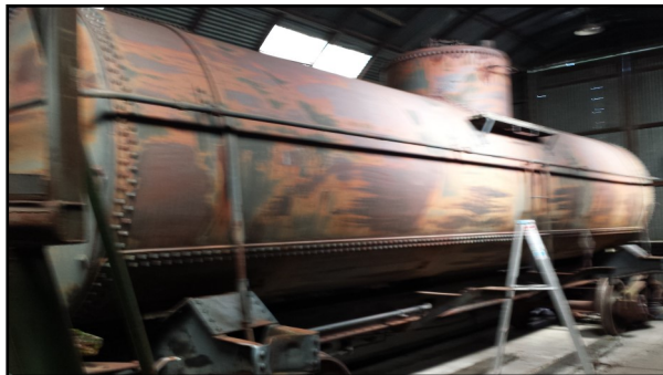
Above Left: Wabash Business Car No. 6 has been restored to its original Wabash Blue paint scheme as work continues inside to restore the interior. Above: The Wabash Car No. 6 before being painted. Left: Restoration work has begun on a set of tank cars that will become part of the car barn display. Below: The Monticello VFW hall was sold to the MRM and will serve as the permanent home for the Polar Express and other museum events.