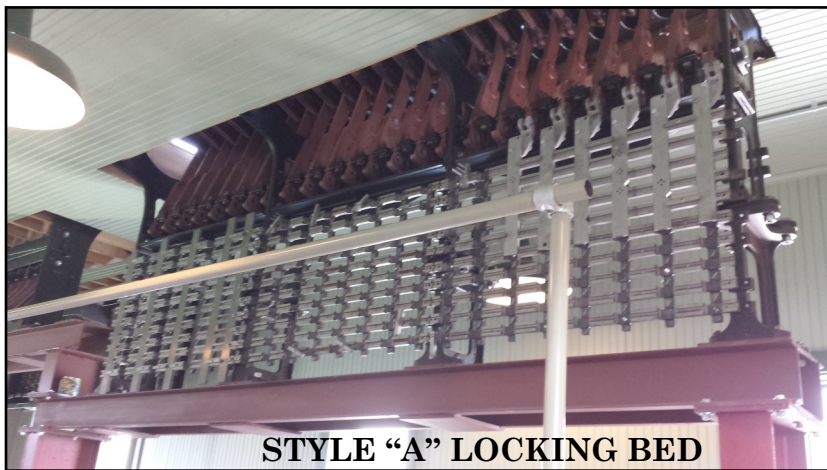
STYLE “A” LOCKING BED

the locking is accomplished. For the Style “A” machine, the locking “bed” is a vertical affair that resides below the floor and is pretty much out of view from the operating position within the tower. The Saxby & Farmer, however, has its locking bed mounted horizontally above the floor. The locking bed sits directly behind the operating levers.