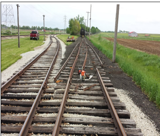
Left: The IT main line at IT Junction is having 90 pound rail replace the 60 pound rail at the junction switch. Approximately 300 ties have been installed on the IT main. Right; New planters were added to the platform at the Monticello depot to welcome visitors.