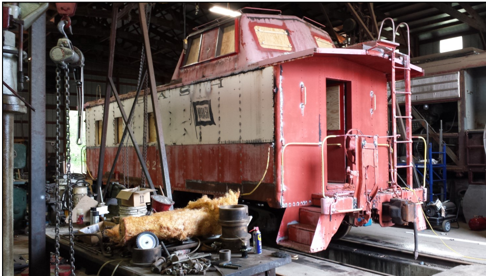
Left: Wabash Caboose 2824 is in the shop undergoing interior restoration by members of the Wabash Railroad Historical Society.