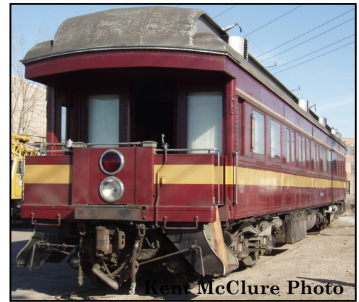
Kent McClure Photo