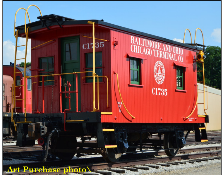
Art Purchase photo