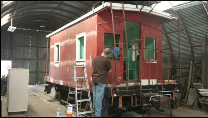
Above: A MRM volunteer is in the process of restoring BOCT Caboose C1735.